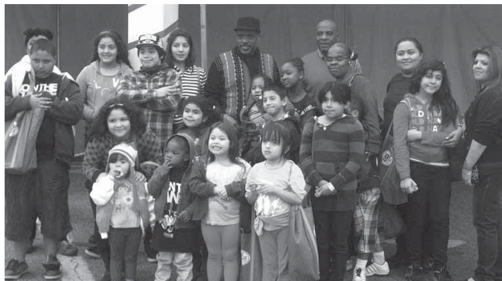
Local families gathered on Sunday for a toy giveaway and holiday celebration.